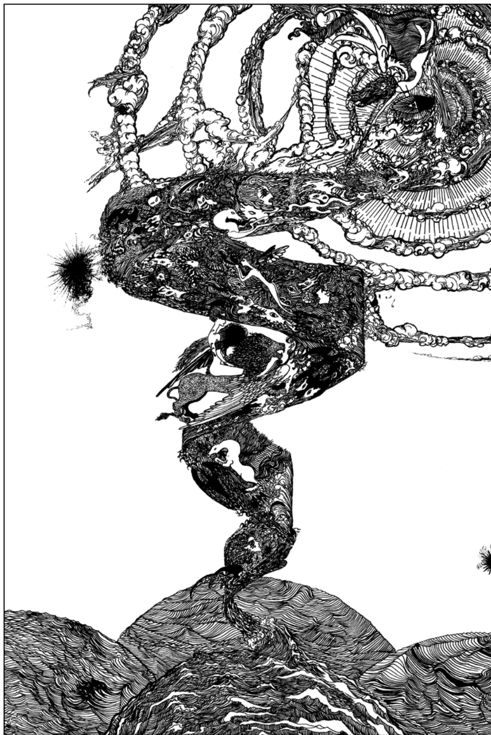
ILLUSTRATION III: «SINCIELO»