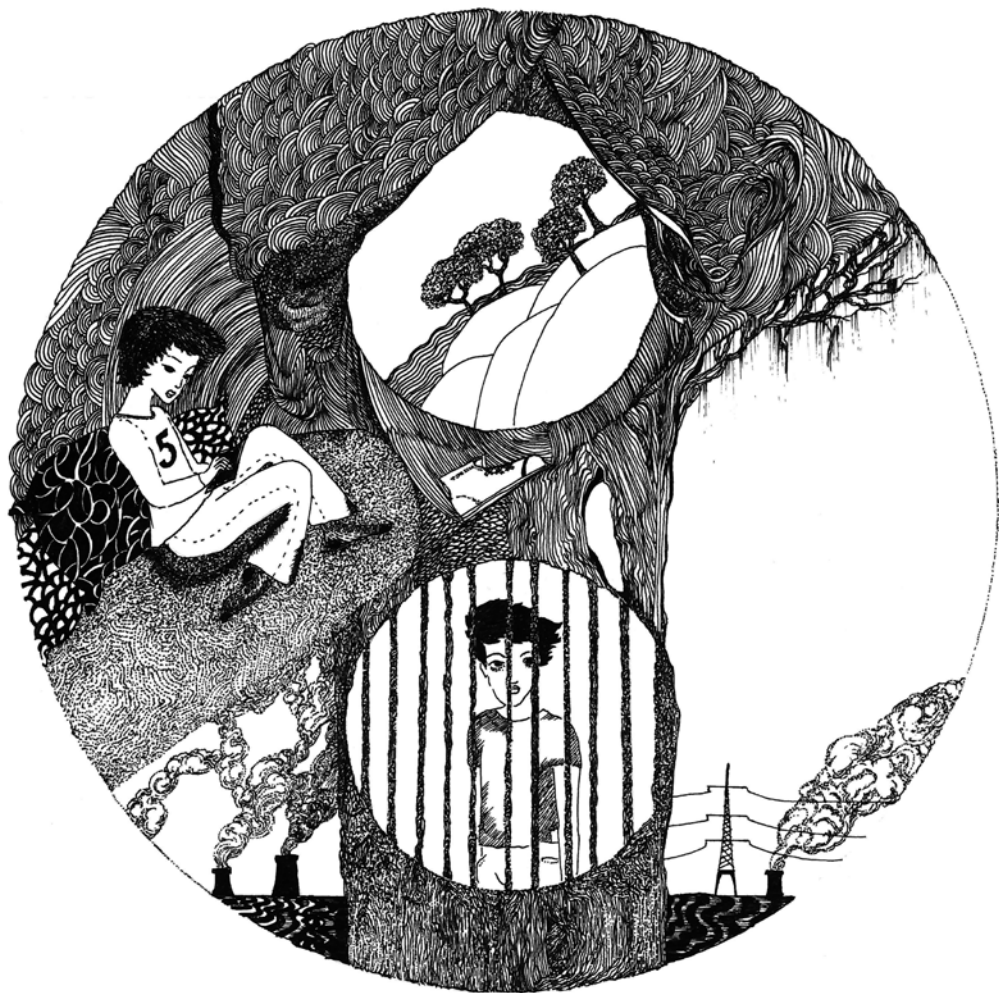
ILLUSTRATION V: «I MADE THESE SHOES FOR YOU ALL BY MYSELF.»