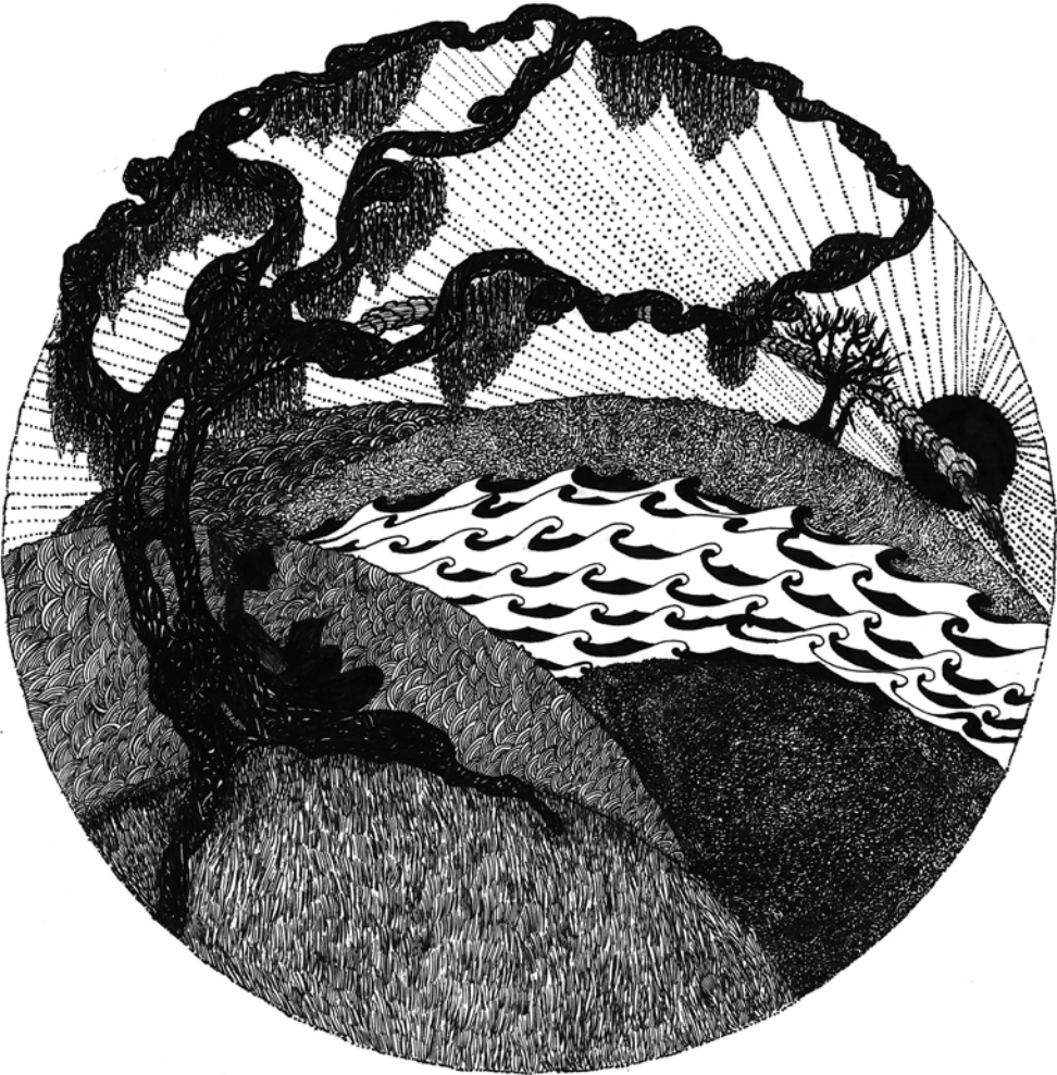
ILLUSTRATION IV: «I WILL RECOGNISE YOU AND WE WILL BE FRIENDS»