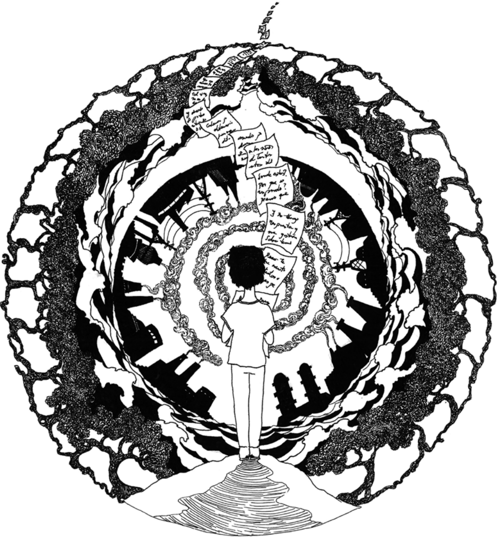
ILLUSTRATION IX: «EVERYBOY»